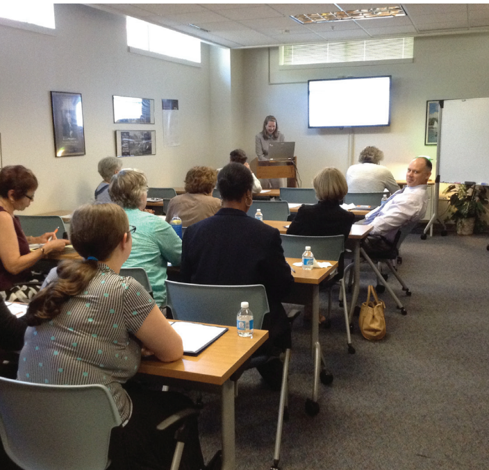
WestlawNext training in the Law Library's classroom. The classroom, as well as our conference room, may be reserved for your use at no charge.