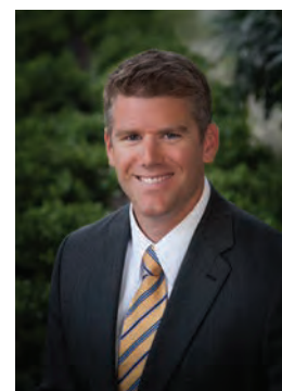
Wolcott Rivers Gates ATTORNEYS AT LAW